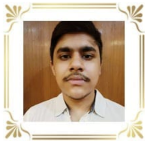
Pavitr Agarwal 94.8%