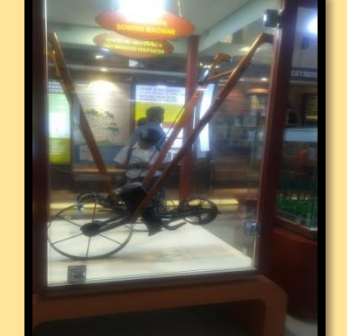
Trip to FRI

The students really learnt a lot and enjoyed the interactive session.