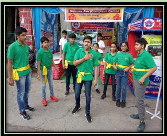
Reaching out to the Crowd