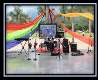
The vibrant venue