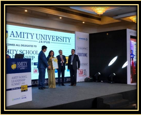
Leading by Example...Congratulations Ma'am!

Amity University Jaipur, Fortune India Magazine & Univariety empowered and recognized the Leaders behind India's Finest Schools at the Amity Leadership Summit.