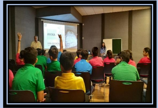
Time to Reflect and Interact