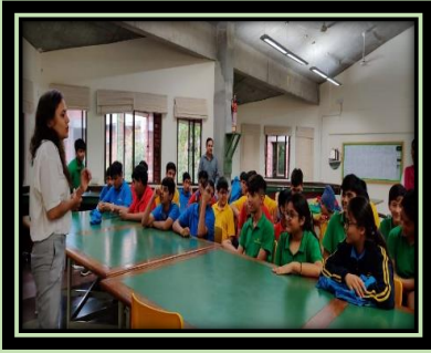
Making a Difference