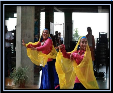
The Folk Fervour

Kāsiga recently organised an Inter-House Performing Arts Competition where students put up a gala show and mesmerised everyone with their talent. The competition was held in four categories namely, 'Roots' - the folk dances of India, Tabla, Sing-Along, Band and Indian Vocal. The results were as follows: