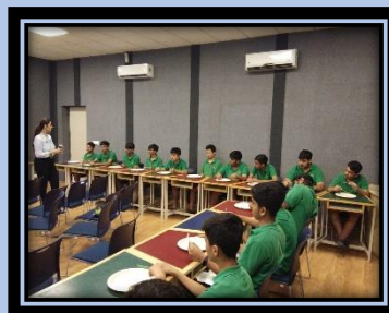
Finesse with Flair