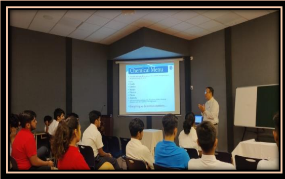
Budding Scientists @ Brainstorming Session