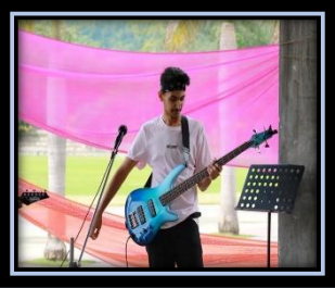
And we rock...