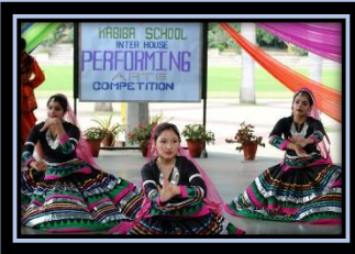
Ghoomar- The Spirited Sway