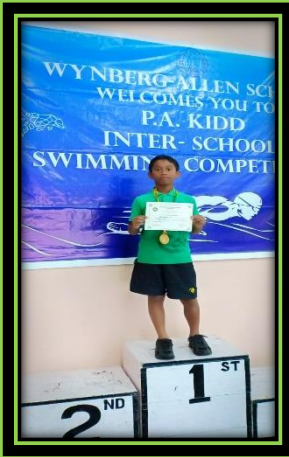
Picture24 Our Young Achiever