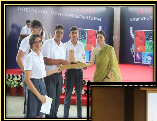
The Winning Streak