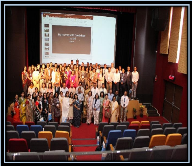
Swarm of Leaders