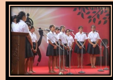
The Divine Chants of Geeta

To uphold the true spirit of life advocated by Lord Krishna, the school organized the 11th Inter-School Geeta Paath.