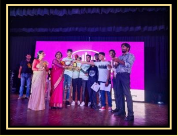
Rock n' Roll

Tula's International School organised a cultural fest 'CONFLUENCE' in which 22 schools from Dehradun, Mussoorie and Rishikesh took part. The fest was filled with colours, talent and creativity. Kāsigans put in their heart and soul in their renditions and won these laurels: