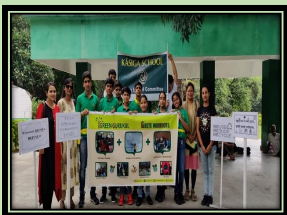
Kasiga Eco Warriors

The Green School committee of Kāsiga School spread awareness over the growing problems of pollution through a Nukkad Naatak presentation at Gandhi Park, Dehradun.