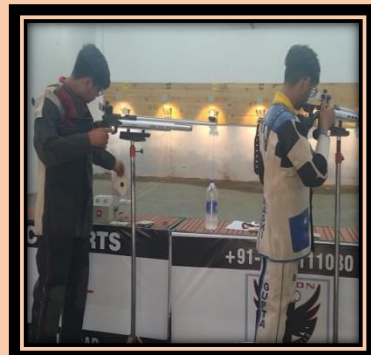
Aiming for Stars

Kasiga participated in Uttarakhand State Inter-school / College Shooting Championship. The championship was held at RISS, Pondha. Our shooting stars brought laurels to the school in their respective categories by winning 2 Gold, 6 Silver and 2 Bronze making it 10 medals in all.