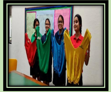
Best Out Of Waste

To boost creativity and environment sensitivity among students, Green School Committee organised a paper bag and cloth bag making activity in collaboration with a local NGO MAD (Making a Difference by Being the Difference). This activity inspired students to contribute to Mother Nature by using paper bags and saying no to plastic bags.