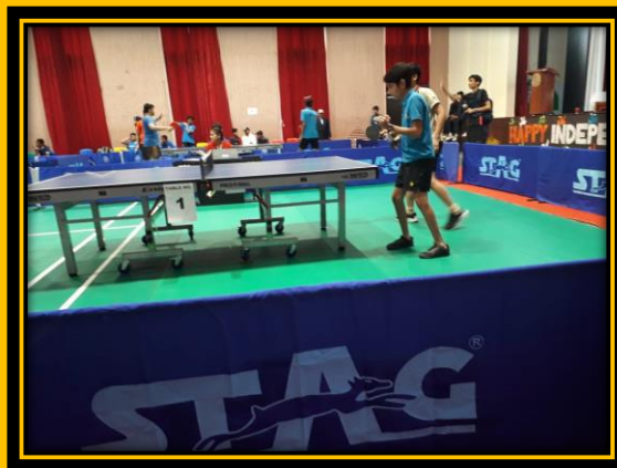
Skill and Agility