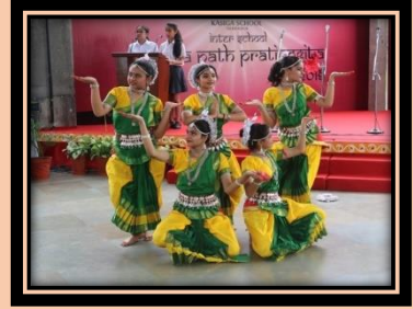
Invoking the Divine the Odissi Way